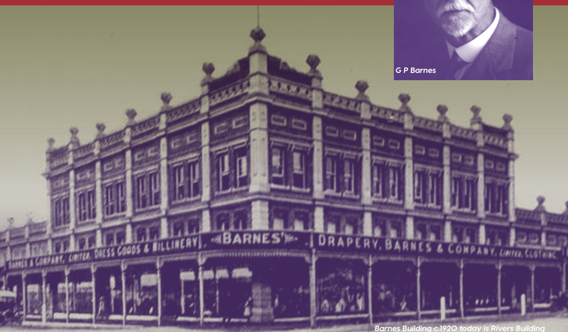
Barnes Building c.1920 today is Rivers Building